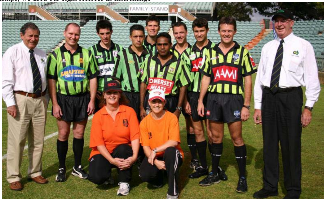
Officials at the Australian Secondary Schools Under 15 Championships, Perth - June 2006